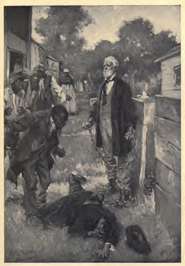
"'Take dat f'um yo' equal-""